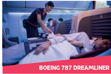
BOEING 787 DREAMLINER

180-degree, Full-flat Seats Seat pitch: 74 in. Seat width: 23 in.