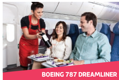
BOEING 787 DREAMLINER

Ergonomic Seat - Recline: 5 In. Seat pitch: 31 in. Seat width: 18.5 in.