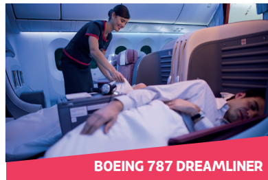
BOEING 787 DREAMLINER

180-degree, Full-flat Seats Seat pitch: 74 in. Seat width: 23 in.