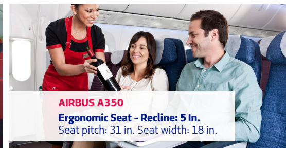
AIRBUS A350 Ergonomic Seat - Recline: 5 In. Seat pitch: 31 in. Seat width: 18 in.