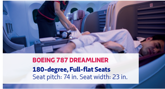
BOEING 787 DREAMLINER 180-degree, Full-flat Seats Seat pitch: 74 in. Seat width: 23 in.