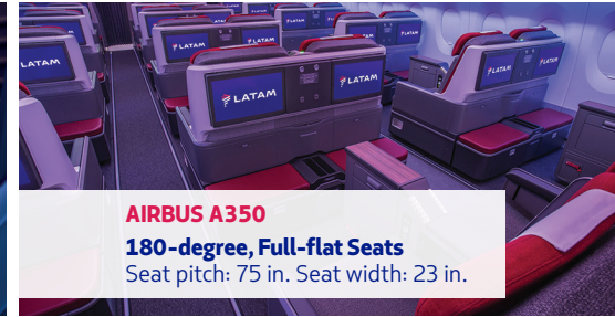
AIRBUS A350 180-degree, Full-flat Seats Seat pitch: 75 in. Seat width: 23 in.