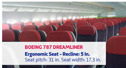
BOEING 787 DREAMLINER Ergonomic Seat - Recline: 5 In. Seat pitch: 31 in. Seat width: 17.3 in.