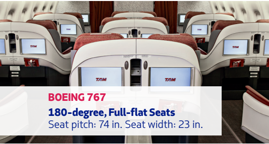
BOEING 767 180-degree, Full-flat Seats Seat pitch: 74 in. Seat width: 23 in.

Complimentary amenities Kit: LAN/Salvatore Ferragamo, TAM/Rituals